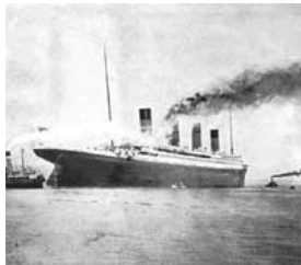
DOOMED: Titanic sets sail from Southampton on April 10, 1912. She sank five days later

Southampton will stage a series of events to commemorate the tragedy Exactly 96 years ago, on April 10, 1912, the greatest passenger liner of her time gently eased away from the Southampton dockside, her decks packed with excited passengers all looking forward to the voyage ahead.