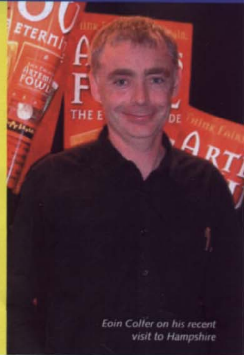
Eoin Colfer on his recent visit to Hampshire

Remember to check out the SLS website www.hants.gov.uk/library/schools . Why not add it to your favourites!